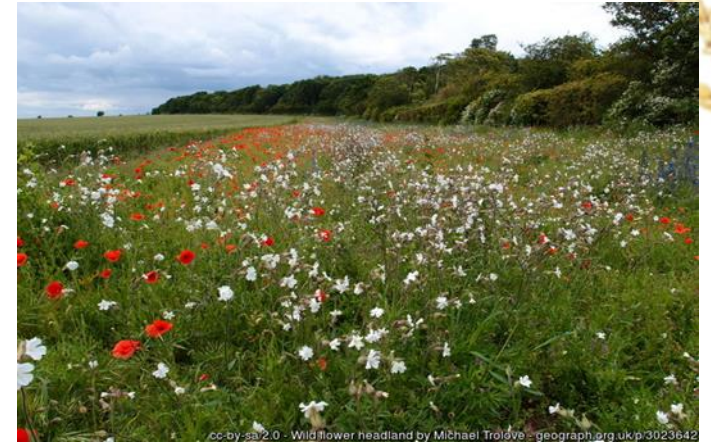
Pollen and nectar areas