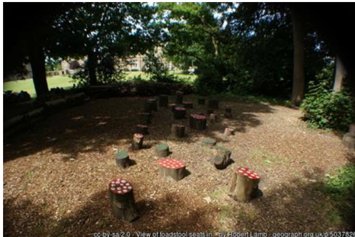
View of toadstool seats in

Make places to sit, make dens and enjoy the wildlife