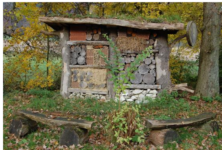
Mini beast hotels