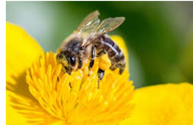
Plants for pollinators