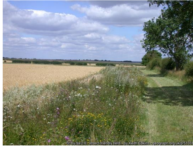
Wild bird cover and food