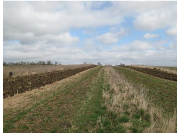
"Beetle banks" in crops