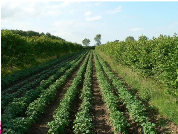
Agro - forestry