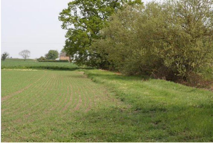
Grass margins around crops